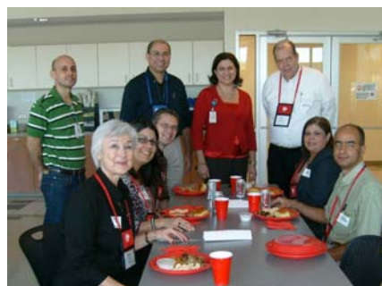
A typical Christmas meal in Puerto Rico – lechón asado (roast pork), pasteles, tembleque, etc. – was for lunch on Friday.