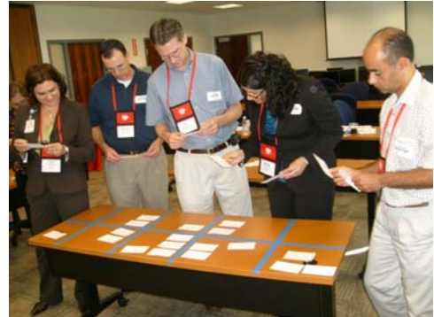
Participants arrange ideas using affinity groupings.

The participants also enjoyed an extensive tour of Medtronic’s Cardiac Rhythm Disease Management plant where they were able to observe many best practices.